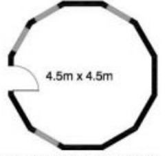
STUDIO (NOT ACTUAL LOCATION)