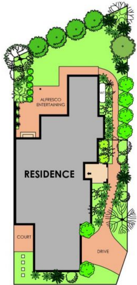
SITE PLAN not to scale