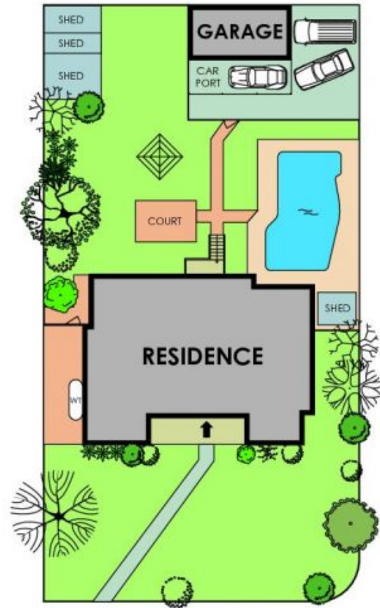
SITE PLAN not to scale