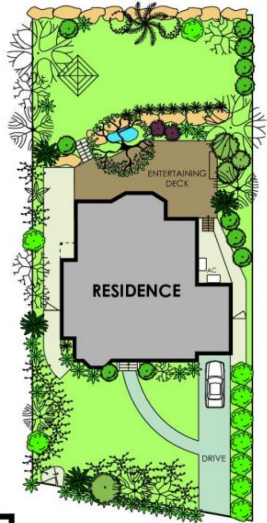
SITE PLAN not to scale