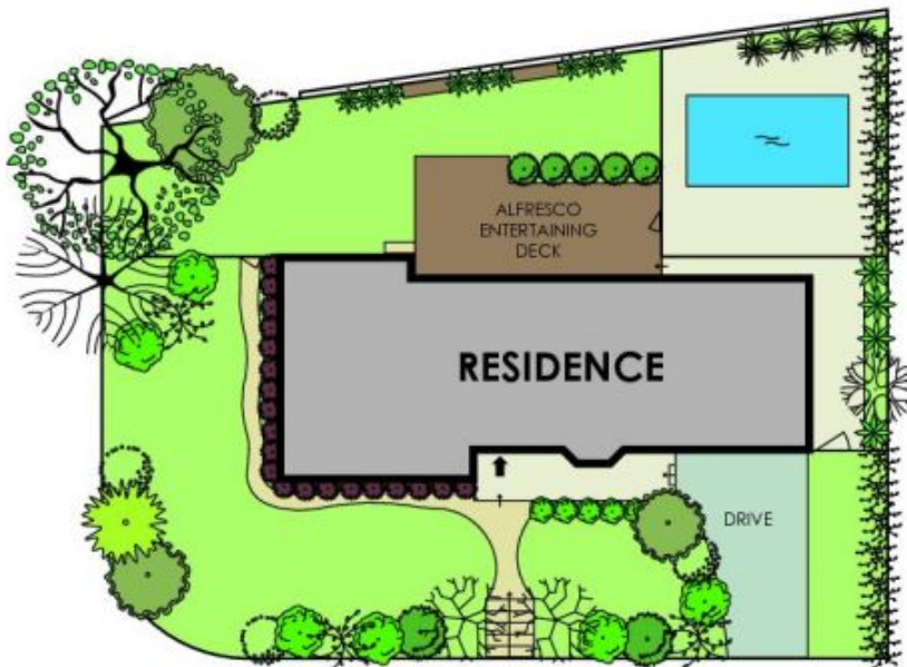
SITE PLAN not to scale