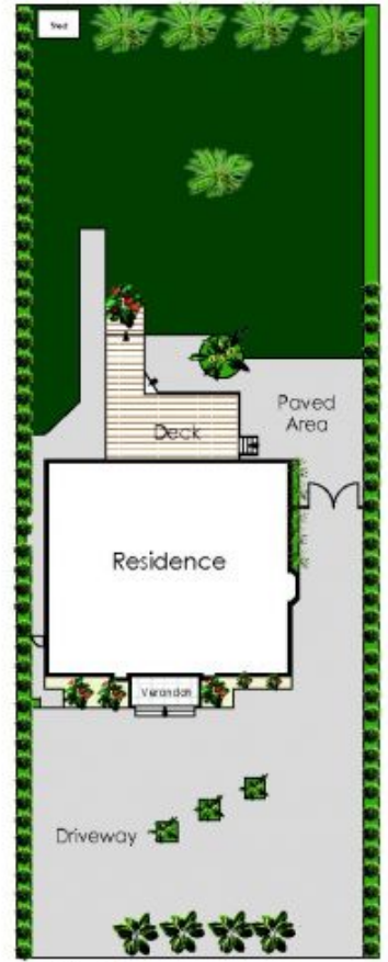
Site Plan (Scale approximate)